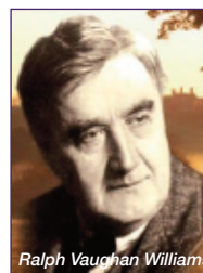
Ralph Vaughan Williams